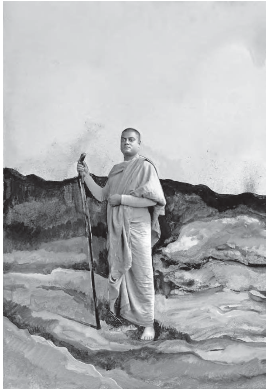
PAINTING: DIPTI CHAKRABORTY

It would be incorrect to say that Swamiji views any one of the four yogas as the only way to God-realisation. As we have already seen him state, 'The Yogas of work, of wisdom, and of devotion [karma yoga, jnana yoga, and bhakti yoga] are all capable of serving as direct and independent means for the attainment of Moksha' (1.92–3). The other three yogas, apart from meditation, can each lead, on its own, to the Self-knowledge, jnana, which gives rise to liberation. Each of these yogas serves, in its own way, to